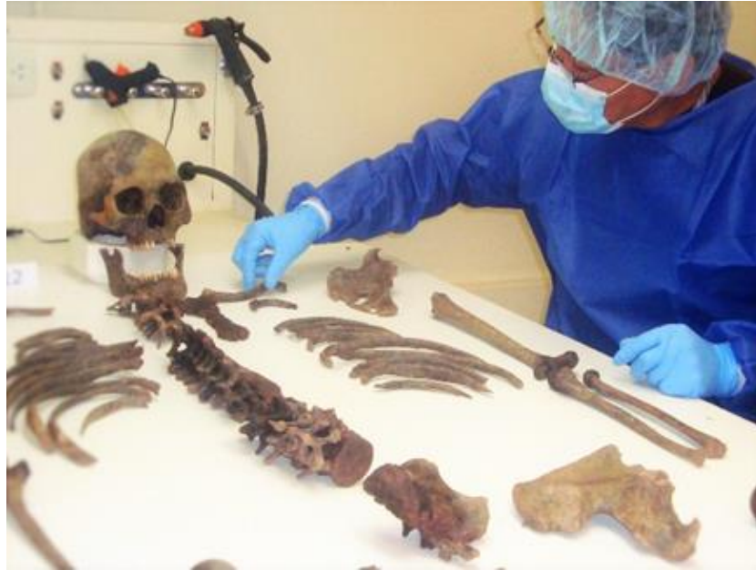
Fig. 2. Skeletal reconstruction, in the laboratory of Forensic Physics anthropology