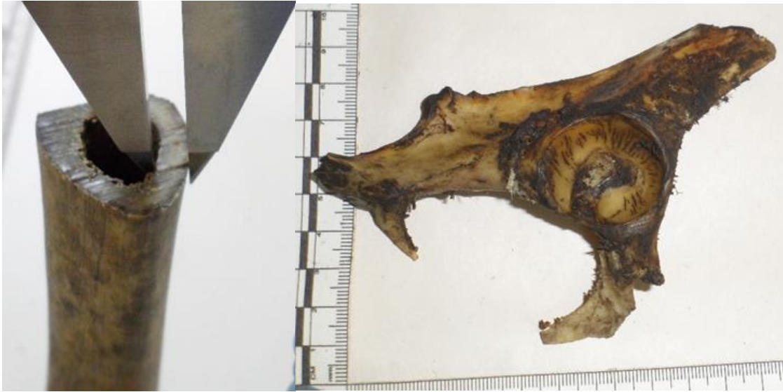
Fig. 4. On the left side, we appreciate the measurement of the diameter of the medullary canal; on the right side, wide obturator hole, transverse predominance, small acetabulum.