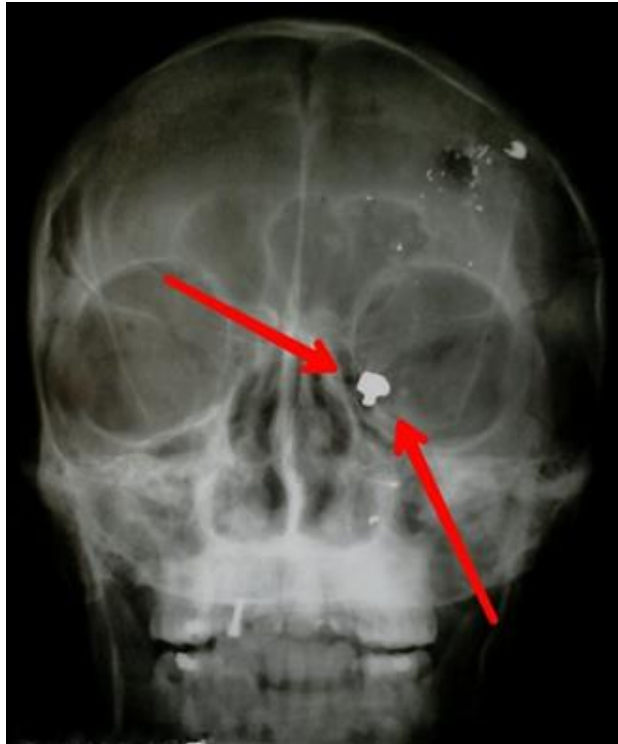
Fig. 1. X-ray of the skull. It shows a foreign body of metallic density (PAF) in the inner wall of the left orbit, anterior floor; note the presence of metal density splints in the calotte and upper left maxilla.

modifying the skeleton (with clothes) (see figure 1).